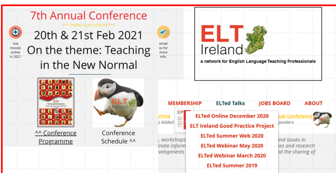
ELT Ireland Events