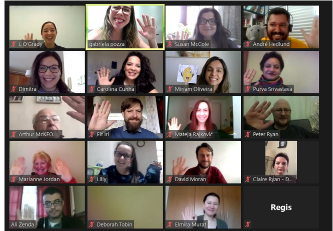
Our Online ELTed Events

Our Manager Meet-ups have changed format from being hosted on Wednesday evenings to a half-day Friday event. Our first ever Friday Meet-Up, in January 2020, was a huge success with great input from all involved, this particular event was based on 'Dealing with Uncertainty'. Additionally, ELT Ireland were asked to participate in a 'Good Practice Project' whereby members were interviewed and their responses recorded either on our YouTube Channel or in our Bulletin for all of our members to access. This allows for managers, administrators, directors of studies, and teachers to share their ideas and thoughts on best practice during this time. We are looking forward to a time where we will be able to host these types of events in person.